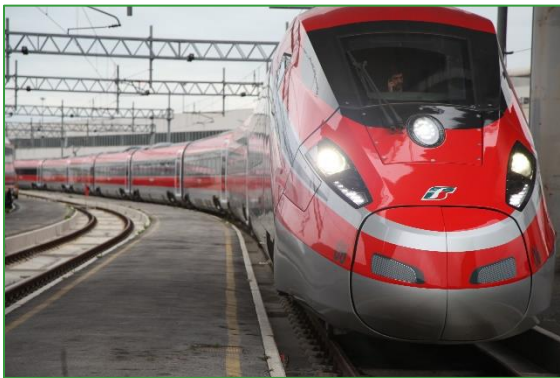
Figure 5: Trenitalia Train Exterior