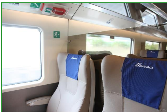
Figure 1: Business Class Seating, Trenitalia