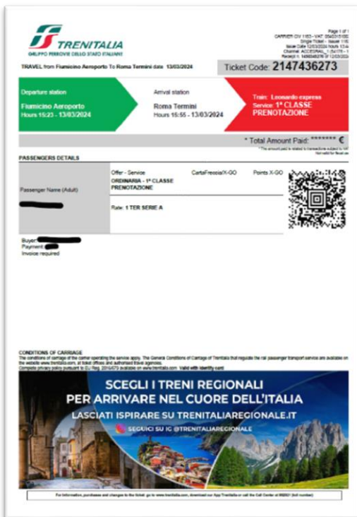
Figure 8: Airport Express Ticket Example

Passengers who arrive at Fiumicino Airport or Malpensa Airport will receive two tickets and a Second page, instructions on how to take the express service, when they check-in. The red section at the top of the ticket indicates if it is the airport express train, or if it is a Freccioargento or Freccirossa train.