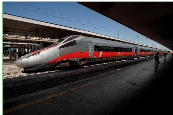
Figure 6: Trenitalia Train Exterior