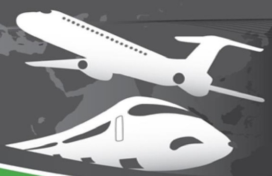
Figure 9: Check-in Page