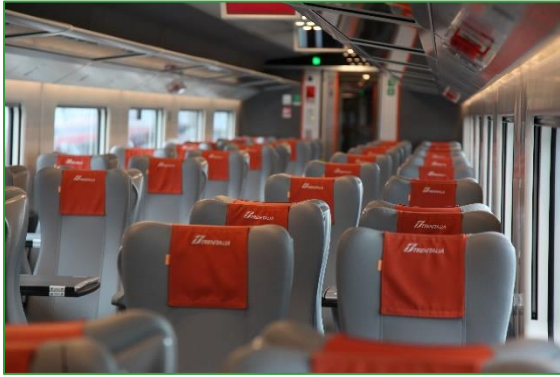
Figure 3: Standard Class Seating, Trenitalia