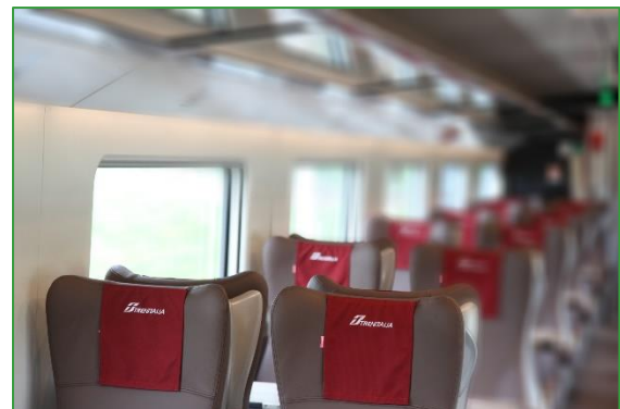
Figure 2: Premium Class Seating, Trenitalia