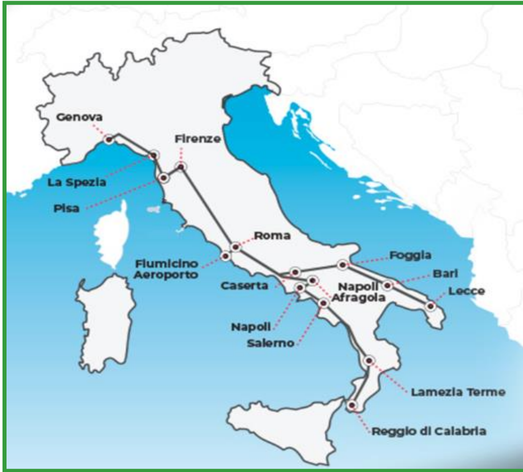
Figure 2: Frecciargento Map