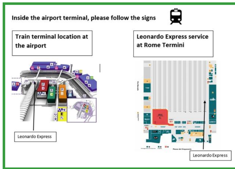
Figure 10: Leonardo Express Stations

The Leonardo Express departs every 15 minutes and takes 32