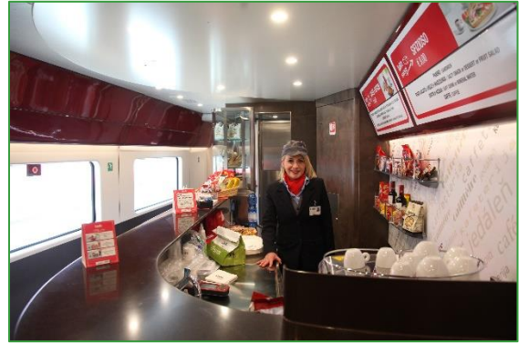
Figure 4: Dining Car, Trenitalia