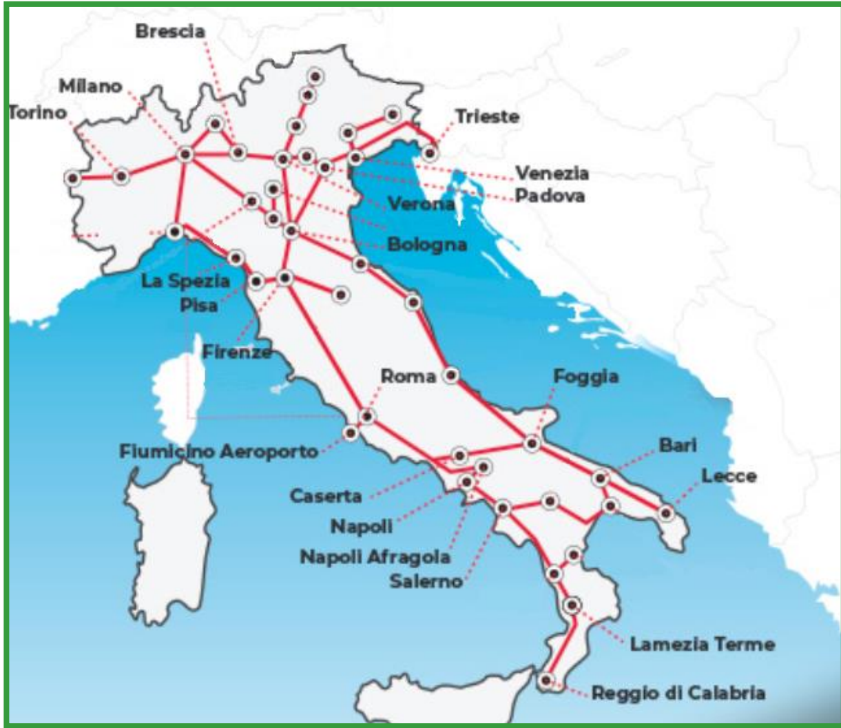
Figure 1: Frecciarossa Map