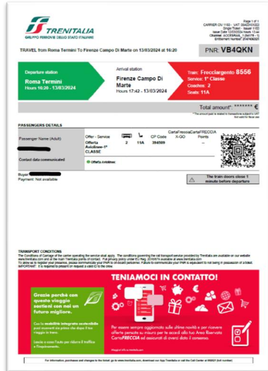
Figure 7: Trenitalia Train Ticket Example

Passengers must check-in to retrieve their actual travel documents (Figure 7). Check-in can be done beginning 72-hours prior to departure. Check-in is done on https://check-in.accesrail.com/#/step1 (Figure 9) using the passenger's name as it appears in the booking and either the booking reference or 13-digit ticket number.