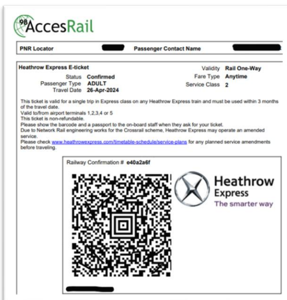
Figure 5: Heathrow Express Ticket Example

At Heathrow Airport in London, passengers will have to make their way to the Heathrow Express stop. Passengers can catch the Heathrow Express from Terminal 2&3, with a 15-minute journey to Paddington station, or from Terminal 5, with an extra 6 minutes added to the journey downtown.