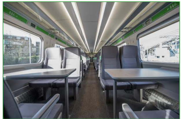
Figure 2: Standard Class Seating and Luggage Rack for GWR