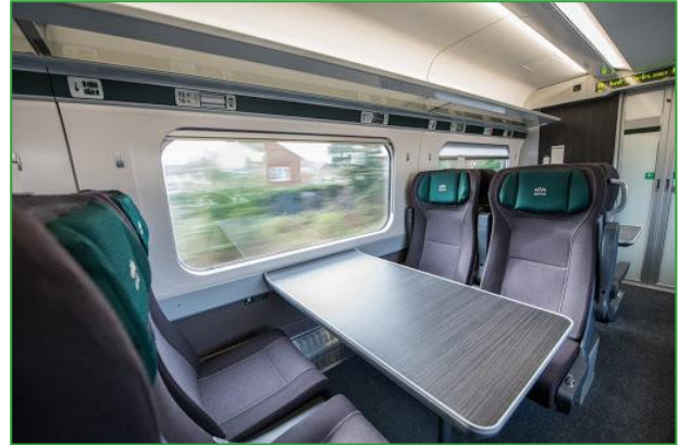
Figure 1: First Class Seating and Luggage Rack for GWR