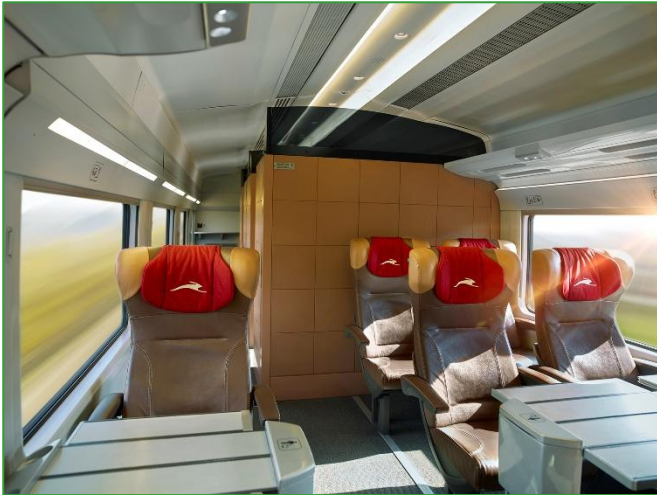
Figure 1: Italo Club Executive Train Car Interior