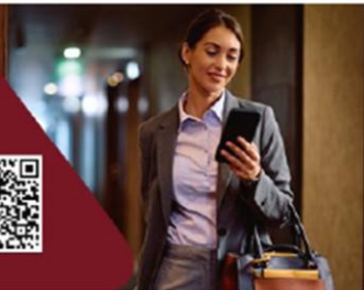
Figure 6: Italo Train Ticket Example