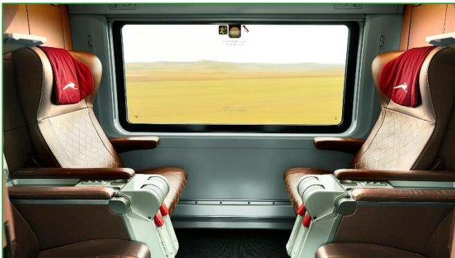
Figure 3: Italo Club Executive Train Car Interior