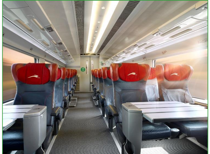
Figure 2: Italo Prima Train Car Interior