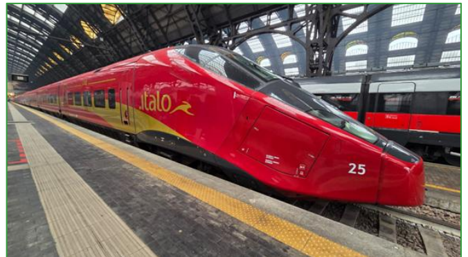
Figure 4: Italo Train Exterior