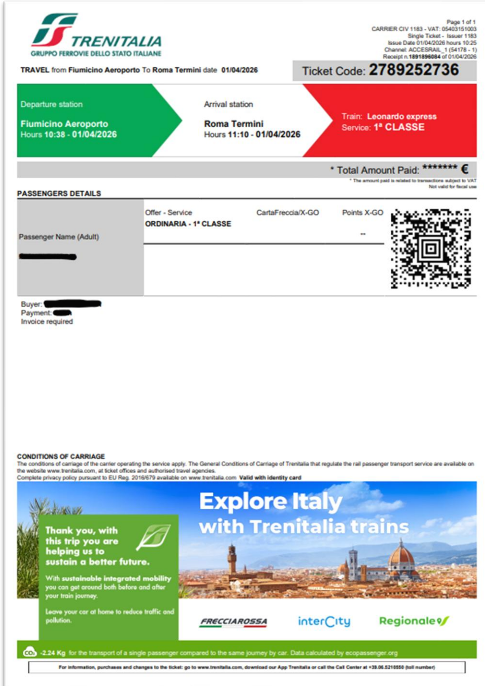
Figure 7: Airport Express Ticket Example