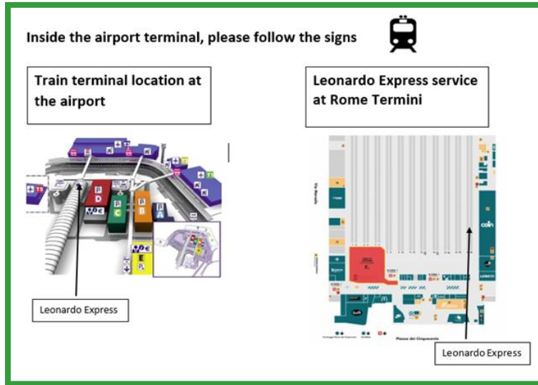
Figure 8: Leonardo Express Stations

Passengers who arrive at Fiumicino Airport in Rome will receive a ticket for the Leonardo Express (Figure 7). The Leonardo Express is an express service between Fiumicino Airport and Roma Termini. Passengers can follow the blue signs in the Airport which will lead them to the Leonardo Express train terminal. The Leonardo Express departs every 15 minutes and takes 32 minutes to reach Roma Termini from Fiumicino Airport.